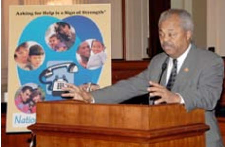
Representative Donald M. Payne (NJ)

Congressman Donald Payne, New Jersey, graciously hosted a National Parent Leadership Month celebration in Washington DC in collaboration with Parents Anonymous® Inc. on February 13, 2007. Many Congresspersons and key staff attended to honor Parent Leaders from state and local districts.