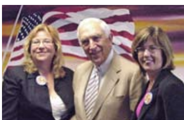
Senator Frank Lautenberg (NJ)