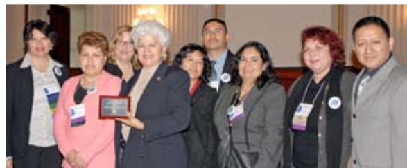
Representative Grace F. Napolitano (CA)