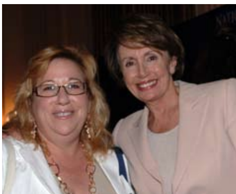
Speaker Nancy Pelosi (CA)